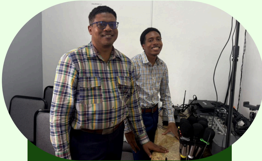
Media and Tech Team