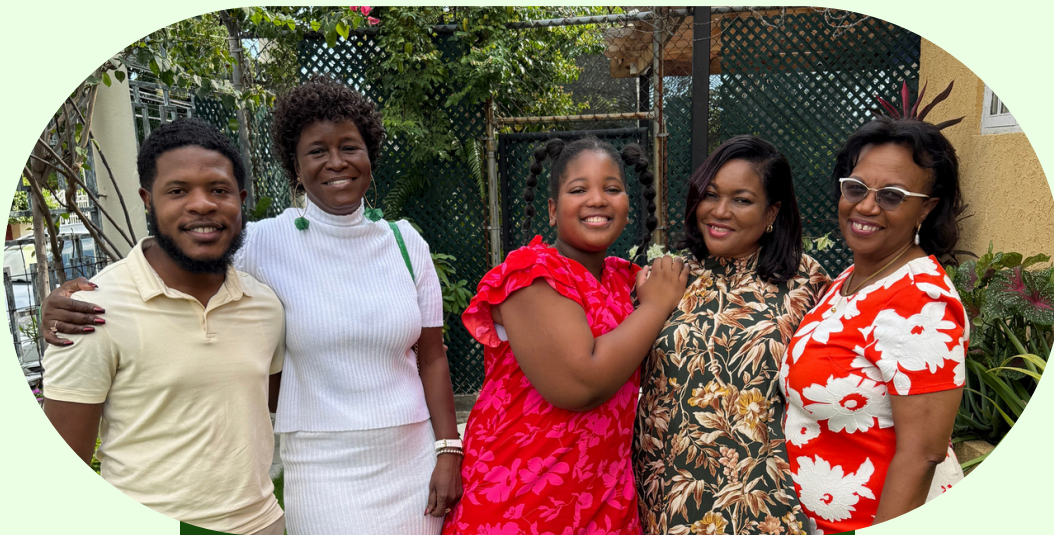
Hospitality and Welfare Committee