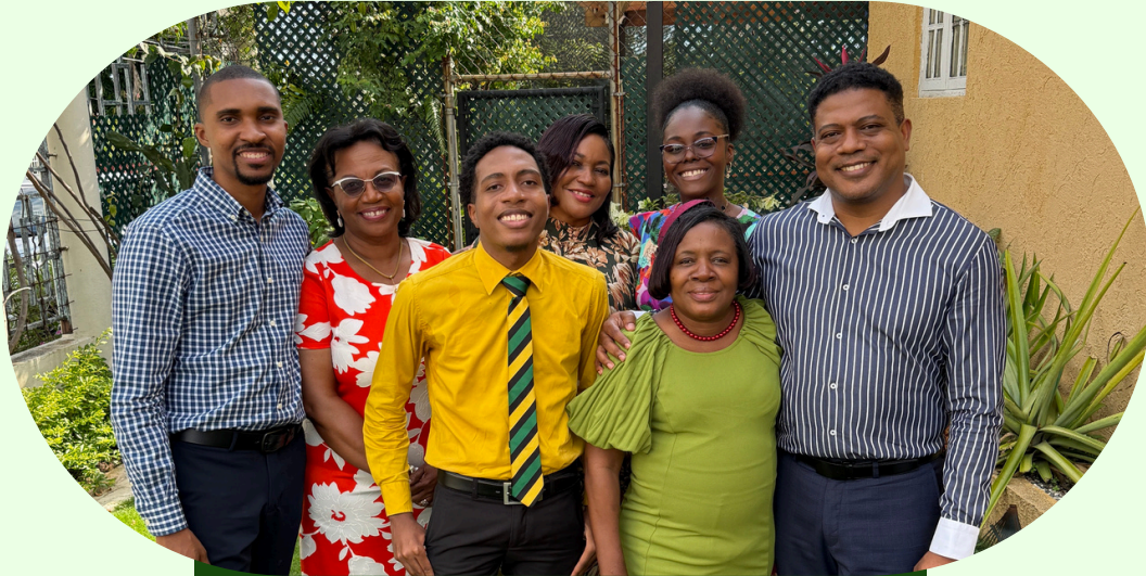
Leaders and Watchmen