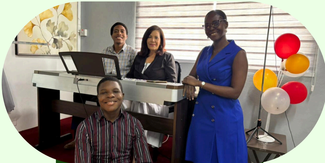
Praise and Worship Team