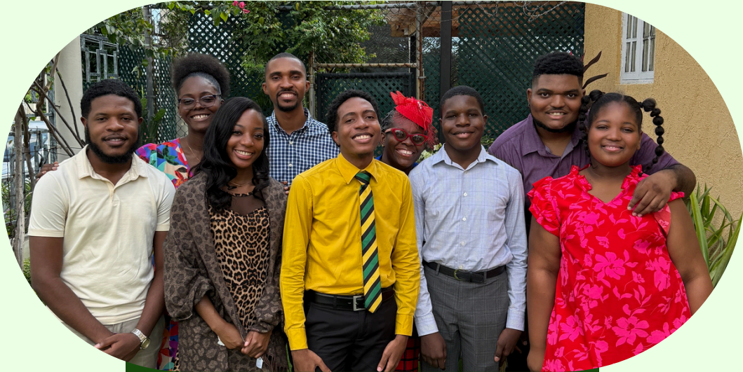
Youth in Action